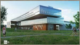
Kenosha Innovation Center