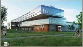
Kenosha Innovation Center